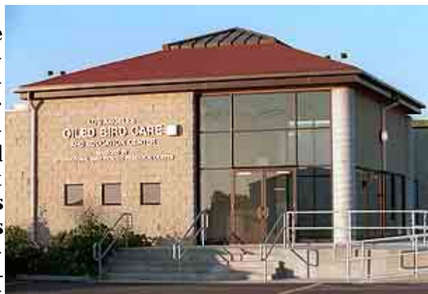
The new Los Angeles Oiled Bird Care and Education Center in San Pedro.

The new center in the LA region occupies a one acre site and includes a 12,000 square-foot structure devoted to administration, classrooms, conference facilities, basic amenities and a 7,000 square foot area for bird washing and rinsing, veterinary services, necropsy, isolation, food preparation, bird drying, and recovery. Also, the facility will contain four habitat pools and four therapeutic pools as well as numerous aviaries for the various bird species. To enhance its public education capabilities, the center has two classrooms, a large window and audio system to allow interaction between visitors and hospital staff, and TV monitors to facilitate bird viewing throughout the facility.