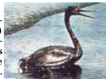
In the aftermath of a spill.

The center will be managed by the International Bird Rescue Research Center (IBRRC) of Suisun City, California, which was established in 1971 in response to the disastrous collision of two tankers underneath the Golden Gate Bridge in the San Francisco Bay. The IBRRC develops oiled wildlife cleaning and rehabilitation techniques, promotes research, and provides oiled wildlife response services.