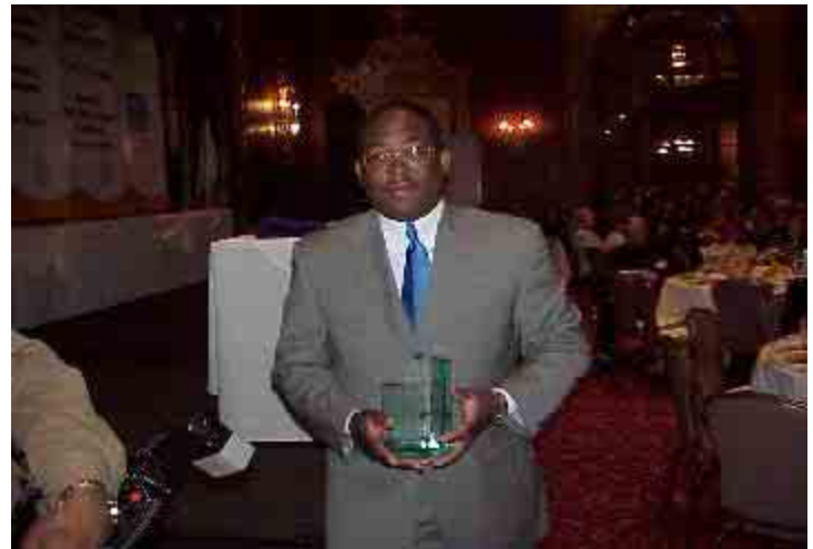
Councilmember Mark Ridley-Thomas receiving a Clean Air Award.

On October 17, 2001, Councilmember Mark Ridley-Thomas received a Clean Air Award from the South Coast Air Quality Management District (SCAQMD) for "Leadership in Government."