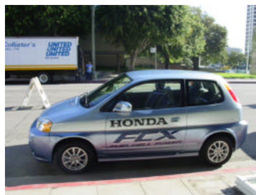
Honda FCX (side view)

Currently, 17% of the City's fleet consists of vehicles that utilize either liquefied natural gas, propane, or electricity as their power source. The addition of the hydrogen fuel cell represents one of the most promising "clean" alternatives for fueling vehicles, as water vapor is the only emitted exhaust product. The 2003 Honda FCX is powered by a hydrogen fuel cell that produces electricity onboard the vehicle. A fuel cell functions by combining compressed hydrogen (stored in a tank) with oxygen in the air to make electricity.