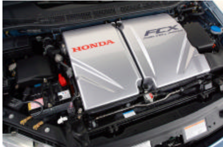
The FCX's engine bay compartment features an electric motor.