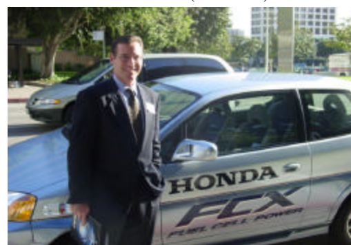
Environmental Affairs Commissioner Jeffrey D. Kabot