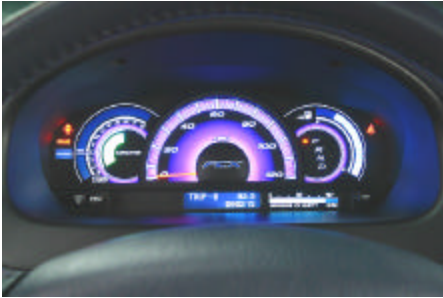
The FCX's in-dash display