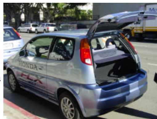
Honda FCX (rear view)